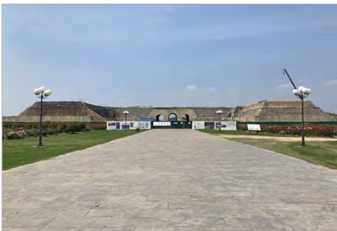
Fig. 1 - Mingzhong Meridian Gate from the southern square, in Fengyang County, Anhui Province. The central arch of the gate frames the Phoenix hill.

terrestrial landscapes in Ming urban planning, advocating for more informed strategies in urban management and exploring the potential role of Archaeoastronomy in guiding conservation efforts amidst rapid urban changes.