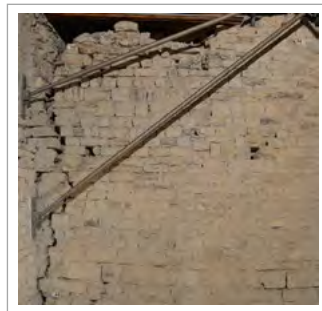
Fig. 1 - Saints Vittore and Corona's shrine: the structural intervention counteracts the out-of-plane rotation of the south façade of the transept without compromising the readability of the seismic damage.

The third chapter first introduces the study context, focusing on the seismic-tectonic situation of Eastern Veneto and the reference earthquake: the January 25, 1348 Eastern Alps earthquake, considered one of the most powerful earthquakes in Central Europe. This is followed by an in-depth archaeoseismological analysis of four case studies: the medieval bell towers of Venice, the bell tower of San Nicolò in Treviso, the ancient staircase towers of Santi Vittore and Corona's shrine in Feltre, and the bell tower of the Abbey of Santa Maria in Follina. These case studies were selected due