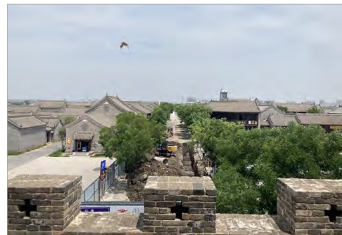
Fig. 2 - View of the central axis of Guide Fu from the top of the Meridian Gate, in Shangqiu, Henan Province.