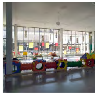
Fig. 1 - Asilo Sant'Elia Kindergarten. The recreation hall before its closure in 2019 (Photo A. Greppi, 27 marzo 2019) Gjirakastër (Pompejano, 2015)

of realizations: in terms of the number of cases (29 buildings), the heterogeneity of the architectural characteristics, and because it reflects the prevailing condition in many areas of Italy. This is the area geographically closest to the Sant'Elia kindergarten. At the same time, for the most cases, it is the territory conceptually furthest from the rational architecture close to Giuseppe Terragni. The research is based on consultation of numerous municipal, parish, kindergarten, association, professional, university and local authority archives, as well as the superintendencies. The archival documents are mostly 'first-hand' and have made it possible to learn and analyze the unpublished history of the design and construction of each