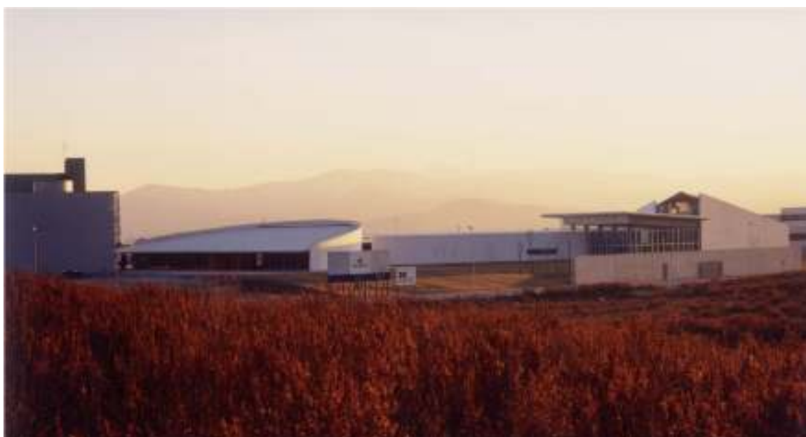
Centre Nodus – Barbera del Vallès